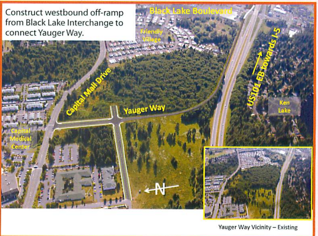
Yauger Way Vicinity – Existing