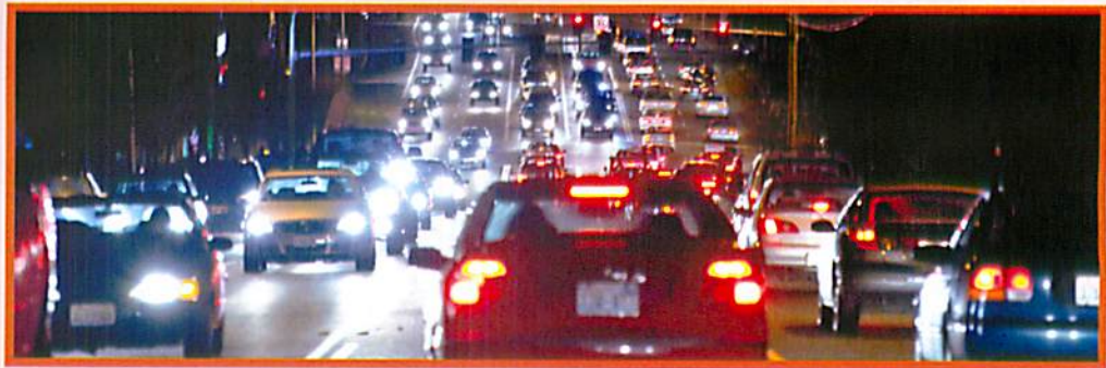
Above: Intersection of Black Lake Blvd and Cooper Point Road